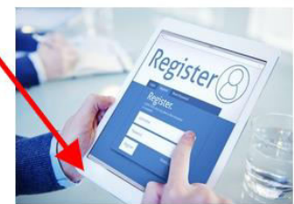
Athletics Electronic Forms

To learn more about our programs, please visit each team's website using the